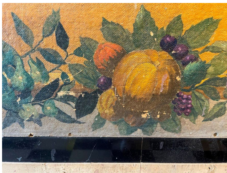
Section of Painting Displaying Holes and Paint Loss

For each painting, Spokeshave Design proposes to construct a protective barrier composed of a wooden top rail and black steel intermediate rails and posts. The barriers would be approximately 9' long and 3' high. The side handrails would be 37" long. The legs or posts would have non-skid foot pads so that the barrier could not be easily moved. These barriers would protect the paintings from being damaged again. The design of the barriers meets ADA standards, with the intermediate rails being within cane sweep. Attached to the barriers, each restored painting would feature a plaque containing the name of the painting and its description. The plaque would also acknowledgement the CPA funding award.